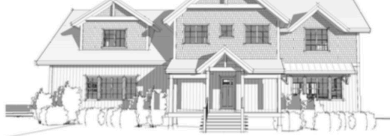
Exterior Perspective 1