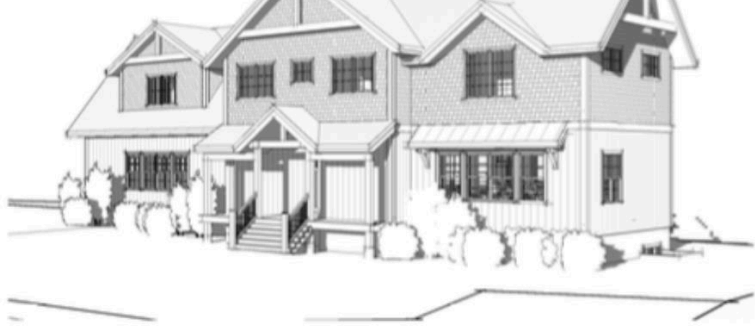
Exterior Perspective 4